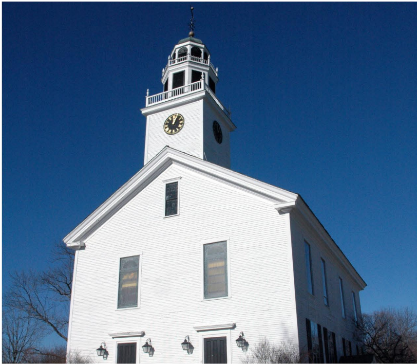
Greenfield Covenant Church, Greenfield, New Hampshire