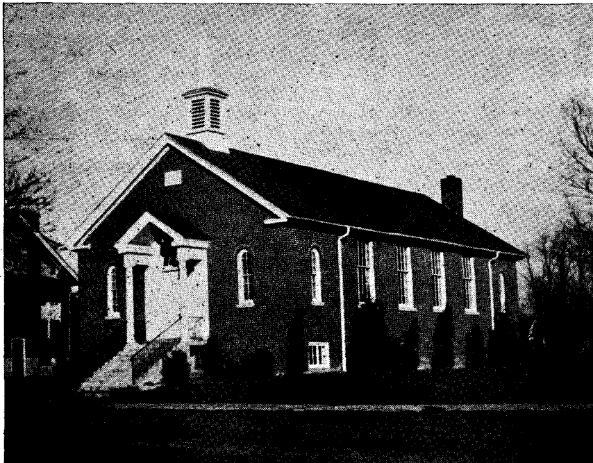
Calvary Church, Middletown, Pa.