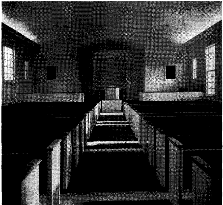
Calvary Church dedicated its 350-seat auditorium only last May.

A parent-sponsored Christian day school uses the educational wing of Calvary Church. This school could lose up to half its enrollment if a large number of the Air Base families now sending their children leave the