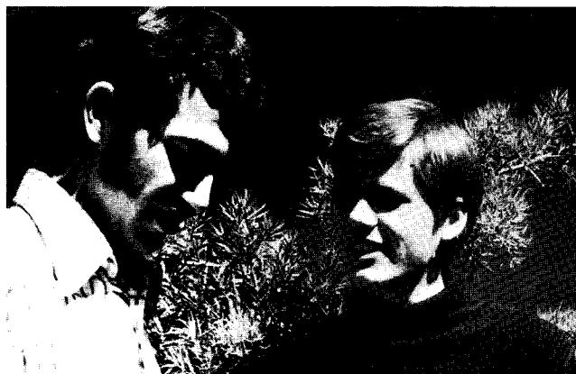
Personal, one-to-one sharing and praying are at the heart of El Camino's ministry.

The College Ministry of El Camino OPC would welcome your comments, suggestions or reactions. If you are interested in more information about our ministry, or would like to know how you personally can help us, please write to us at P.O. Box 15243, Santa Barbara California 93107.