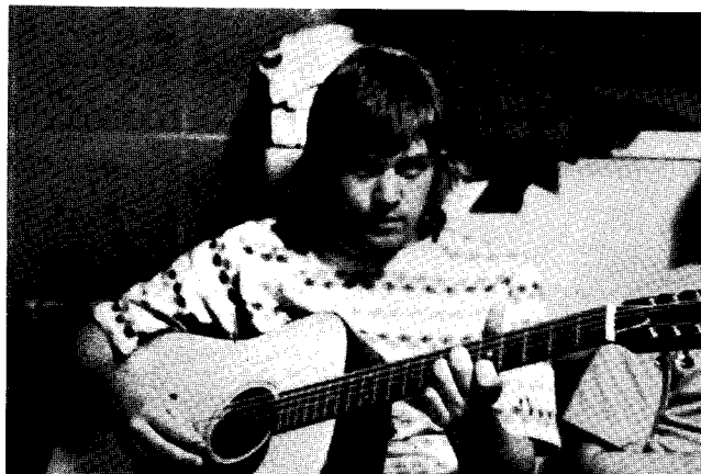
Various Bible studies in campus dormitories and apartments supplement the Church programs and provide a base of operation for evangelism.

The Presbytery responded very generously, and is helping pay the salary for a full-time summer high school director and a part-time youth ministry supervisor in the fall. The summer worker will be supported by a small staff of students who will receive only honorariums for their work. Without the aid of home missions funds from the Presbytery this would not have been possible. When the funds were voted for El Camino's youth ministry, the Presbytery requested that the church send teams of students to the various churches of the southern California area to share what is going on in the youth ministry at Goleta. Several churches have already been visited by teams from El Camino. When possible the teams (from five to twelve people) spend an entire Sunday with a congregation, usually giving a slide show, handling a song service, presenting a short message for the evening, and perhaps giving a small demonstration Bible study or panel discussion. The best parts of the day are always times spent in the homes of the church families. During these hours a great deal of friendly conversation and