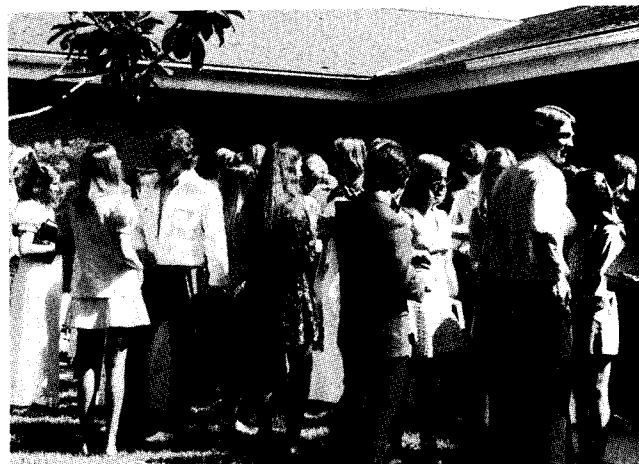
The college students gather together Wednesday nights for a time of singing, sharing, praying, and teaching called "B.A.S.I.C." (Brothers and Sisters in Christ). Before the meeting the students from different campuses and living situations share what God has been doing during the week.

A recent development in the congregation which has the potential of drawing college students closer to the adults, is the establishment of groups of adults (all communicant members or regular attenders) called "Faith Families". These families are intended to promote greater unity among the adult membership of the church, including the communicant members among the college students.